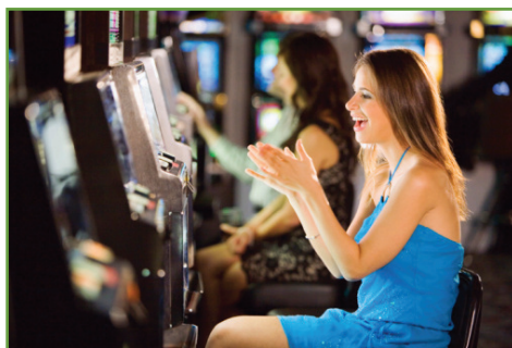
Accelerated game-load times

Featuring 256MB of high speed flash memory, expandable to over 2GB, Rapid Flash includes 512KB of battery-backed SRAM with extended hold-up time and battery threshold monitoring circuitry that is fully compatible with GLI 11. Both bootable and re-programmable by Compact Flash card, Rapid Flash is a rugged and reliable addition to the Pluto 6 family that dramatically extends the useful range and capability of Pluto 6.